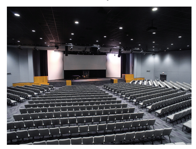
The Worship Center