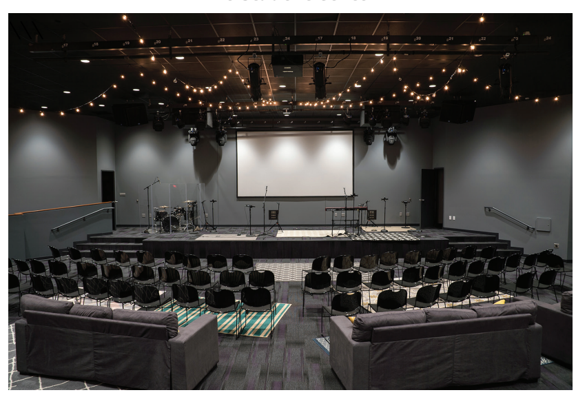
The Student Center

The Student Center Auditorium is the primary facility we use for Weddings on Fridays or Saturdays. We can seat around 250 people in this facility. Fellowship Fayetteville currently has chairs for 120. If the wedding is to seat more than 120 people, chairs will need to be rented by the wedding party. These chairs will need to be removed from the facility with all other decorations prior to the party leaving the facility. Cost for a wedding ceremony at this facility is $475.